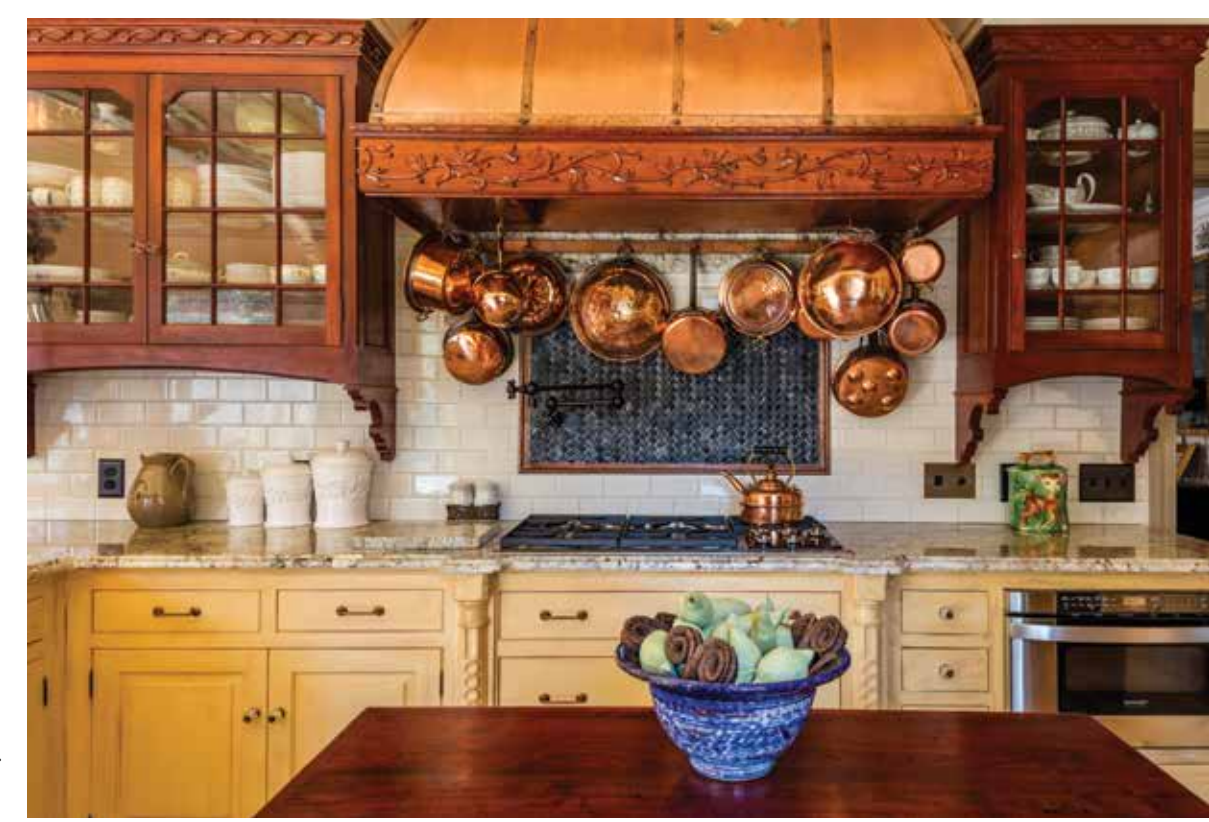
Right: Warm and cozy with an old world feel, this kitchen doesn't shy away from stained woods and a rich color palette. The lower cabinets are painted in Benjamin Moore's Chestertown Buff and the oxidized copper and glass hardware is by Te-Ma. The result: an inviting kitchen perfect for entertaining.

Designer: Leigh Jones with The Very Thing, Ltd.