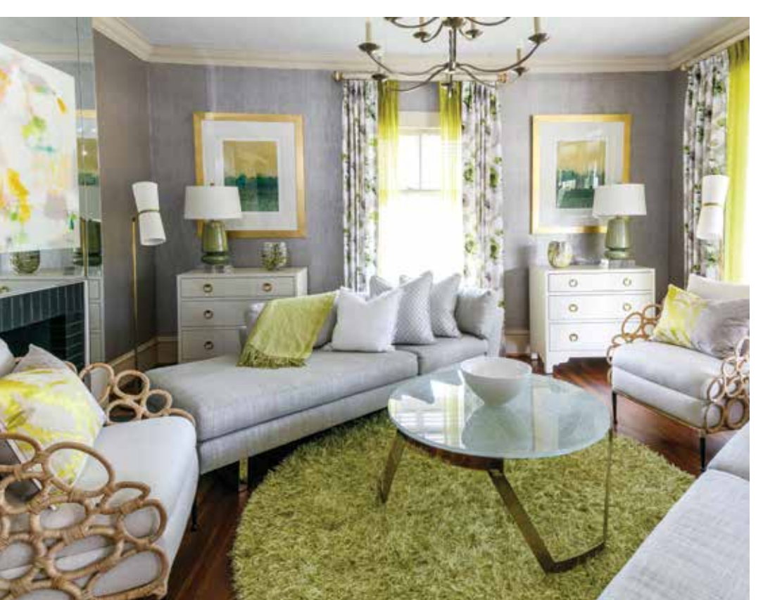
Above: Modern-urban with a pop of color was the goal. The sectional sofa by Norwalk, ottoman by Lexington Home Brands, Jaunty rug, and bold accent pillows gives this old tobacco loft the allure of home sweet home.